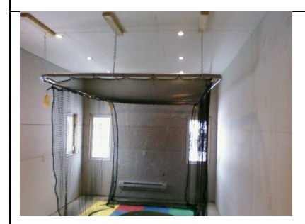
STEP 5: Ensure that the PVC frame is supported in such a way that the net hangs 6 inches on the floor.

Suspend the PVC frame from the ceiling by looping a chain around the PVC so both ends of the chains are hooked.